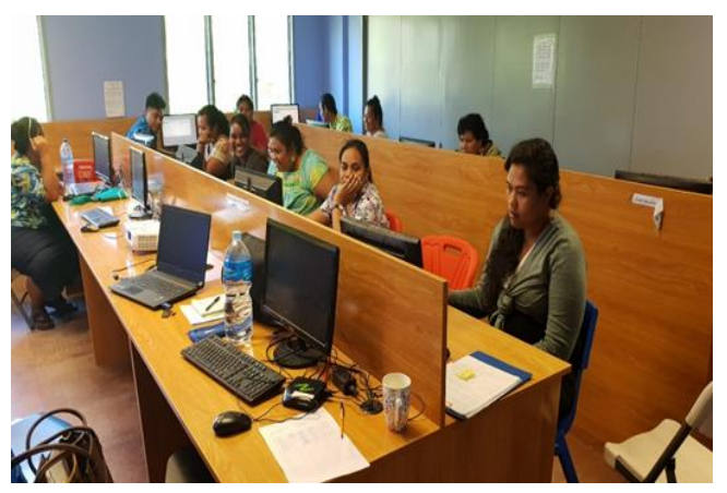
IRS Session in Kiribati

Librarians based at USP Laucala campus visited the campuses in the region in semester 2, 2018 to teach IRS to both undergraduate and post graduate students as well as other stakeholders. The outreach to students on campuses at Lautoka, Labasa, Kiribati, Marshall Islands, Nauru, Niue, Solomon Islands, Tonga and Tuvalu by the Library in this semester was to enable PG students registered in 2018 to complete the mandatory 14.5 hours.