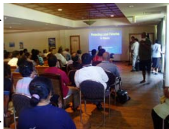
Introducing Fish Reserves to community

that the worlds' marine resources must be harvested using sustainable methods to ensure the replenishment of these stocks.