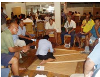
Students laying out ideas for MPA

The actual program implemented on the 21 st of April from 10 am until 4 pm consisted of the presentation of Dr King's research by the R&D Manager followed by the SPC sponsored