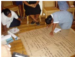
Students laying out ideas for MPA

Two weeks prior to the workshop date, the dissemination of posters and flyers advertising the workshop were put-up in various points around the island. Other details seen to was the selection