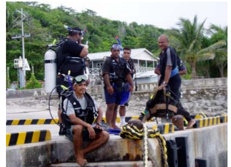
Open water dive participants