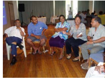
Group Discussions on pros and cons of an MPA.

The workshop also assisted in determining the responsibilities of stakeholders, beneficiaries and legislative enforcers, which most pointed to the communities of the immediate area where the fish reserve is set-up.