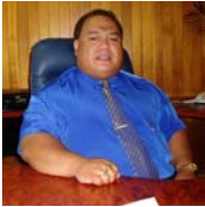
Hon. Russell Kun, LL,B.M.P. Minister for Justice & Fisheries.