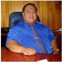
Hon. Russell Kun, LLB, MP. Minister for Justice & Natural Resources.