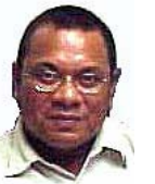
Hon. Marcus Stephen, MP, Minister for Department of Economic Development, (D.E.D), Fisheries and Marine Resources

lifestyle. High on the list of priorities of the Authority is the development of the local communities through technical and training assistance and most recently sports. Fishing, a way of life for the average Nauruan, takes first preference in the sporting arena. Not only does it promote fishing skills but brings in the favourite food source ashore. Happy Angam Day to you all.