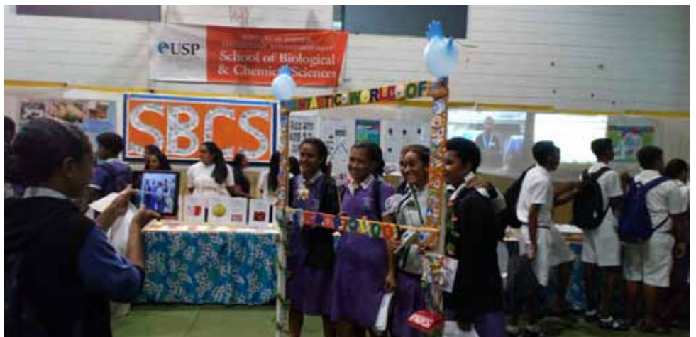
Students take part in the displays at the FSTE booths at the USP gymnasium.