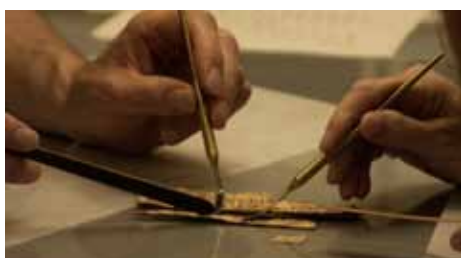
Conservators used gold-handled dental tools and specially-made bamboo lifters to work on the scroll.

delicate work. The fragments, written on birch bark about 2,000 years ago, from ancient Gandhara in present-day Pakistan and Afghanistan, may represent the oldest surviving Buddhist texts ever discovered.