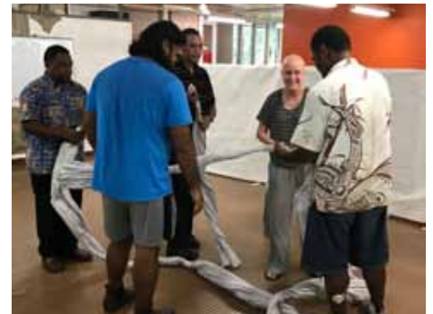
Library staff, some in full concentration whilst others enjoying the camaraderie, putting together the winning display.