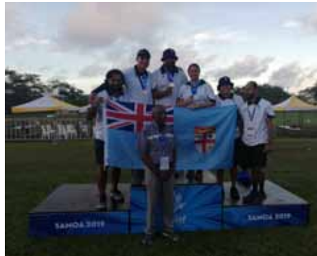
Team Fiji Archery in action and after with their spoils.