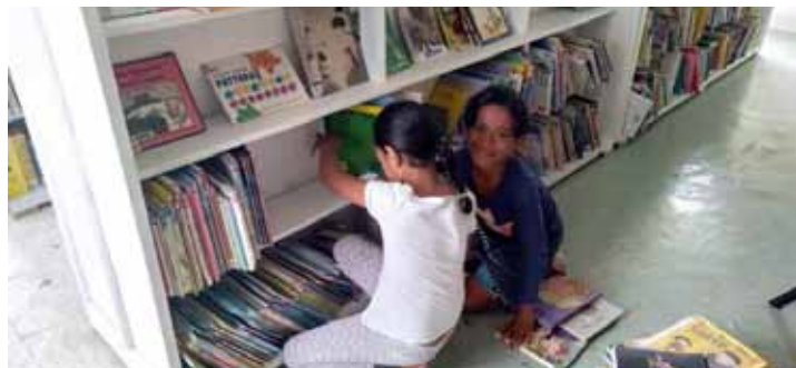
Tongan children helping to put their library together.

Tonga will soon open its first ever public library with thousands of books donated from more than 50 Auckland Council libraries. Access the full report from https://www.rnz.co.nz/national/programmes/first-up/audio/2018711371/tonga-to-open-first-public-library-system-with-thousands-of-books-donated-from-nz