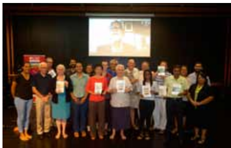
Group photo of attendees.