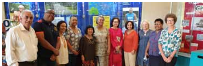
The Malaysian delegation with USP Librarians.