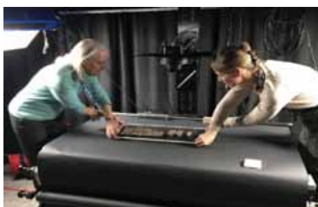
Conservation staff turning the Gandhara scroll during its digitisation.