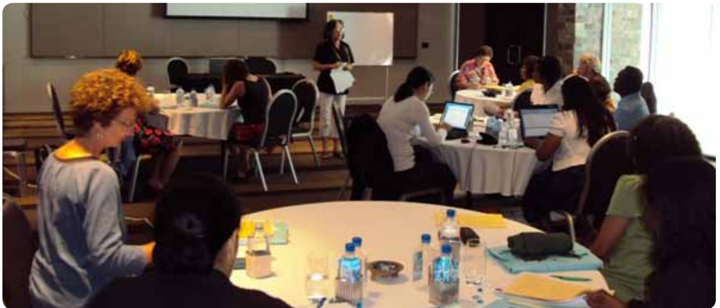
Librarians at the Retreat

The professionals returned from the retreat refreshed for the task of completing the Library's Strategic Plan.